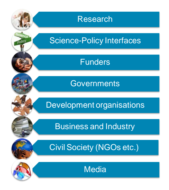
Figure 1: Main stakeholder groups relevant for Future Earth, globally and regionally

Future Earth will engage with and deliver essential knowledge to a wide variety of stakeholders across science, policy, business/industry and civil society communities to address global environmental change issues. These issues are many and strongly linked to human development challenges, and the solutions needed are multidimensional, cutting across scales, disciplines, sectors, in a system of interdependencies and interlinkages. Future Earth will support transformation towards global sustainability.