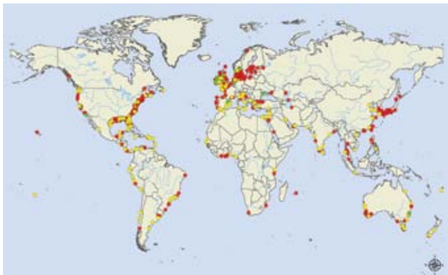
Figure 2. Beyond the tipping point? Oxygen depletion in coastal marine ecosystems. Documented hypoxic (oxygen-depleted) zones, now more than 500 in the world, are doubling every year, causing fish mortality. Although it can occur naturally, hypoxia is most frequently caused by eutrophication, i.e., the overloading of waters with nutrients, especially nitrogen, phosphorous and silicon and/or organic matter. Major sources of this nutrient pollution are agriculture and livestock production, sewage and industrial waste, plus additional complex temperature and water exchange impacts from climate change. Nutrient effects on water oxygen levels are exacerbated when local water bodies become stratified and mixing of layers is prevented. The map shows the location of systems that remain hypoxic (red circles), systems that are eutrophic and therefore at risk of becoming hypoxic (yellow circles), and systems that have recovered from hypoxia (green circles), primarily through reduction of nutrient loads. Sources: Rabalais et al. (2010), Diaz and Selman (2010), STAP (2011a); Map from www.wri.org/project/eutrophication/gallery/maps .