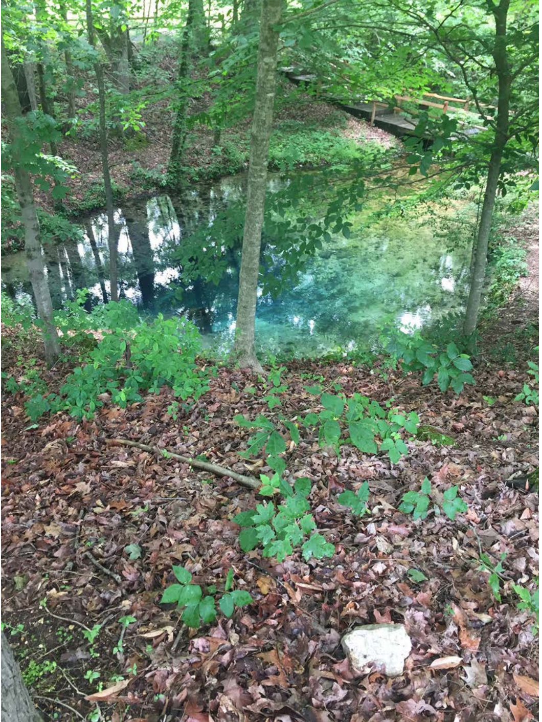
Figure 5. Blue Hole Spring, a gateway to the Underworld.