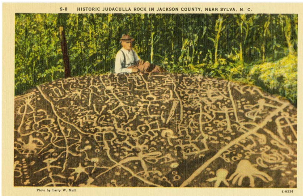
Figure 3. Historic postcard of Judaculla (or Tsul Kalu ) Rock.

This deep history of major environmental changes and geological formations is today embedded in rock, sediment, and soil. Some of it now lies under roads, cities,