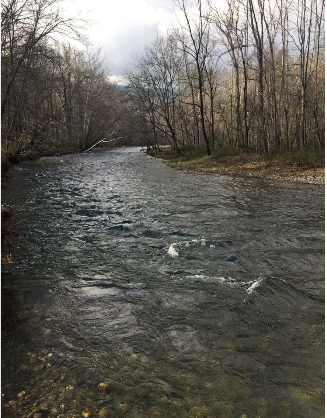
Figure 2. The Oconaluftee River begins life high in the Appalachians at Newfound Gap near the Tennessee-North Carolina border. It flows westward and eventually connects with the Tuckasegee River. The cool, shallow waters of the 'Luftee' flow through the centre of the Qualla Boundary, home to the Eastern Band of Cherokee Indians.