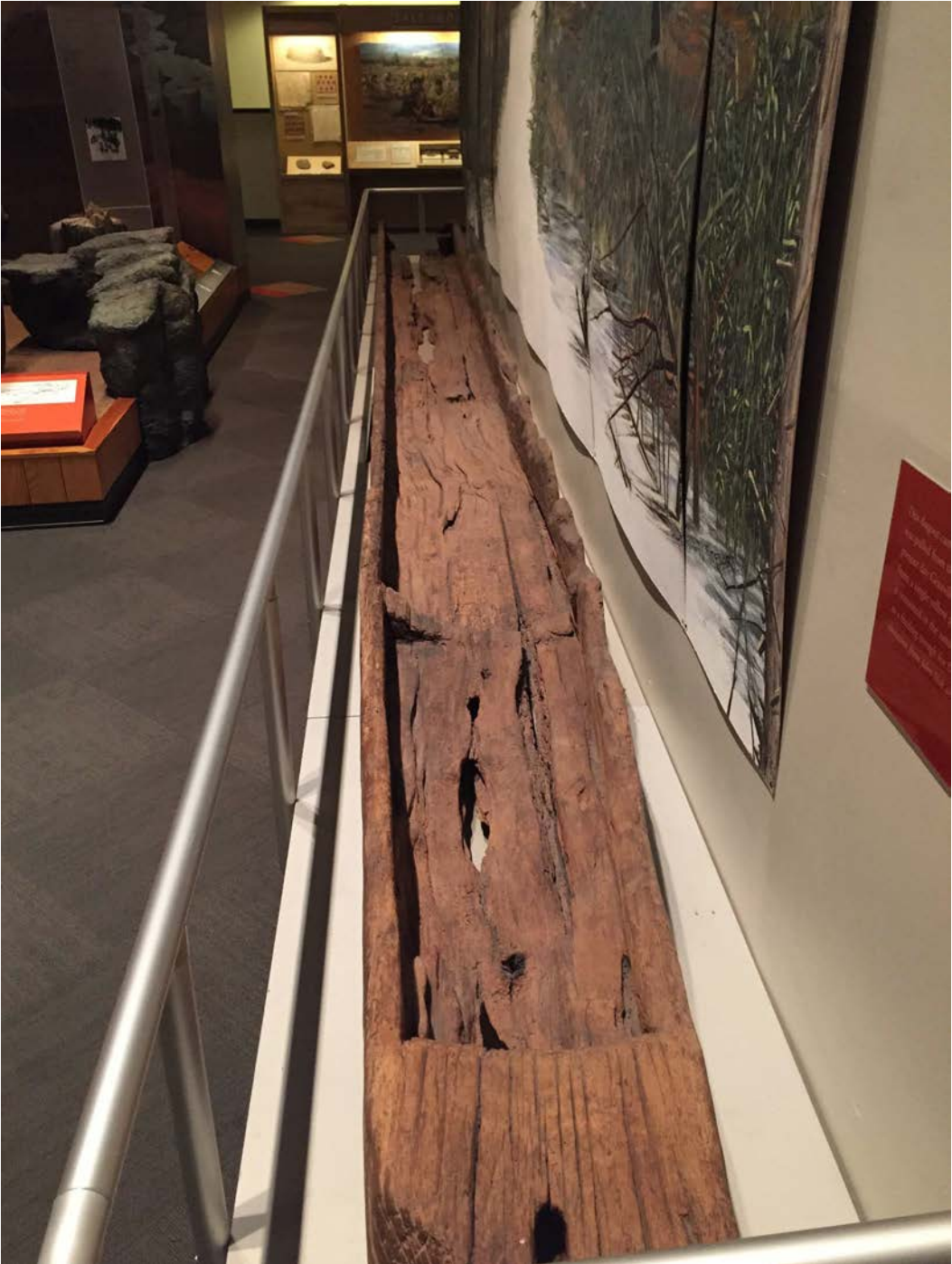
Figure 4. A rare archaeological find, a canoe unearthed in Cherokee country and housed at the Tennessee Division of Archaeology, Nashville, Tennessee.