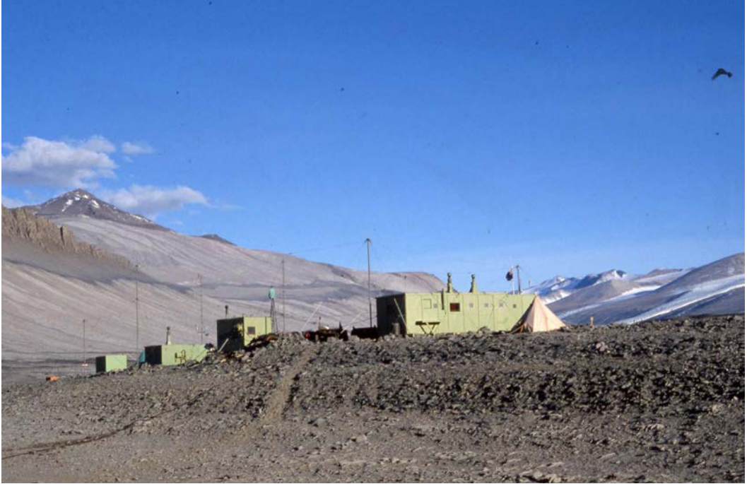
Figure 1. Vanda Station in early 1980s.

‘traditional’ Antarctic culture. Female scientists in particular did not always feel comfortable visiting the station, and by discouraging talented scientists, the culture of Vanda in some ways became an obstacle to doing state of the art science.