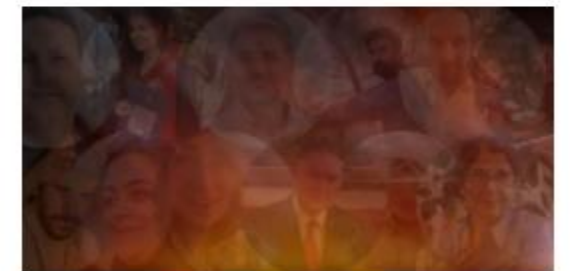
Science and human rights