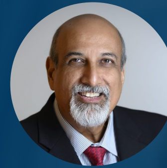
SALIM ABDOOL KARIM