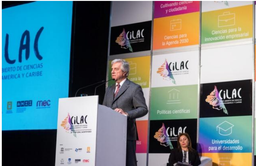
Dr. Tavaré Vasquez President of Uruguay Opening of the event

ICSU ROLAC had an important and relevant participation at the Latin American and Caribbean Open Science Forum (CILAC) that took place in Montevideo, Uruguay on 6th - 9th September 2016. The event was organized by UNESCO and institutions like Grupo Montevideo, Universidad de la República de Uruguay, Intendencia de Montevideo,