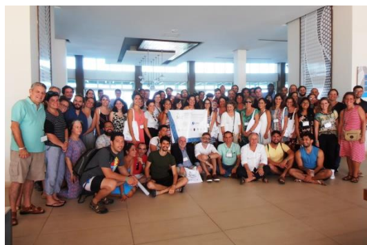
2nd AS&W October, 2018, Ocean Vista Azul Hotel, Varadero, Matanzas, Cuba

Deadline for application: 28 February 2021