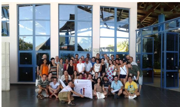
1st: AS&W November, 2015, Hotel Mercure Playa de Oro, Varadero, Matanzas, Cuba

Attendance of Young Postgraduates: It is foreseen that around 50 young scientists from different geographical regions could attend the Advanced School and Workshop. They will be partially or completely financially supported by IUBMB grant and other sponsors. Based on candidate's age/Curriculum Vitae, area of professional research interest, and a letter explaining her/his interest in the course, the academic committee of the course will decide the acceptance of candidates to support their participation. Some Cuban young scientists will be also supported by the National Cuban Society of Chemistry (SCQ) (In particular its Section of Biochemistry and Molecular Biology) as well as the Center of Molecular Immunology, Center for Genetic Engineering and Biotechnology, Center for Drug Research and Development and the University of Havana (UH). The attendance of young scientist will be partially or totally supported according to the candidate conditions and final budget granted.