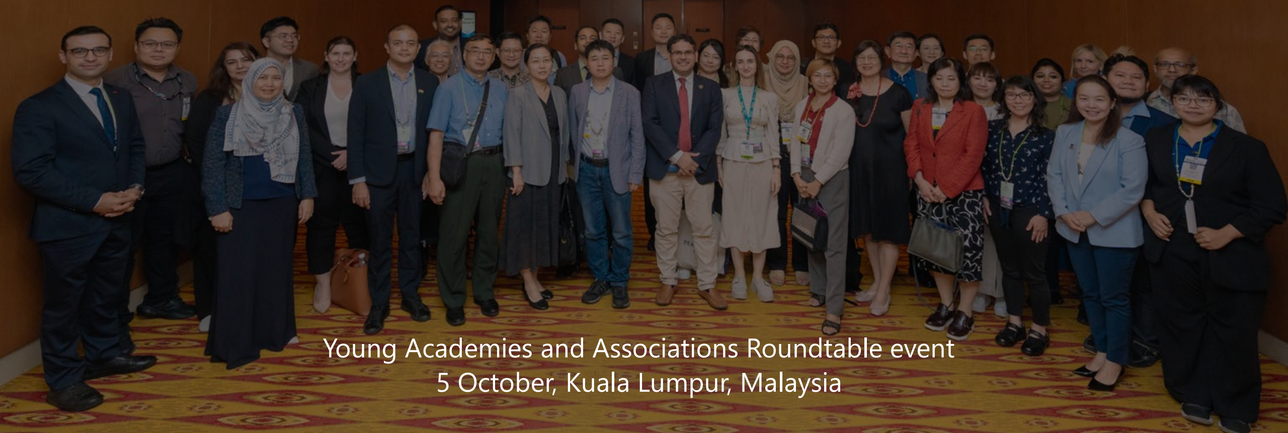
Young Academies and Associations Roundtable event 5 October, Kuala Lumpur, Malaysia

“By nurturing young minds with the right opportunities, we can make a difference in the world.”