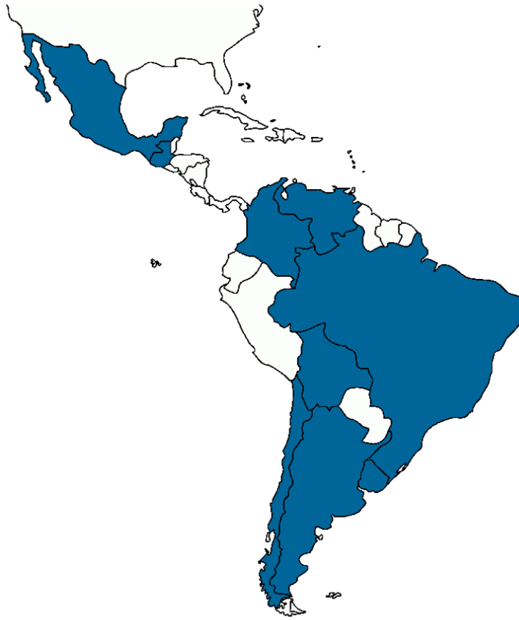
Figure 2b. Countries represented by the members of the Liaison Committee of the ISC RFP-LAC: Mexico, Venezuela, Colombia, Brazil, Bolivia, Uruguay, Chile, Argentina, Guatemala and Bahamas.