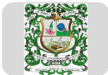
Staff of the Colombian Academy of Exact, Physical and Exact Sciences