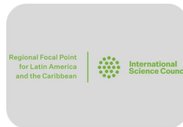
Liaison Committee of the ISC RFP-LAC