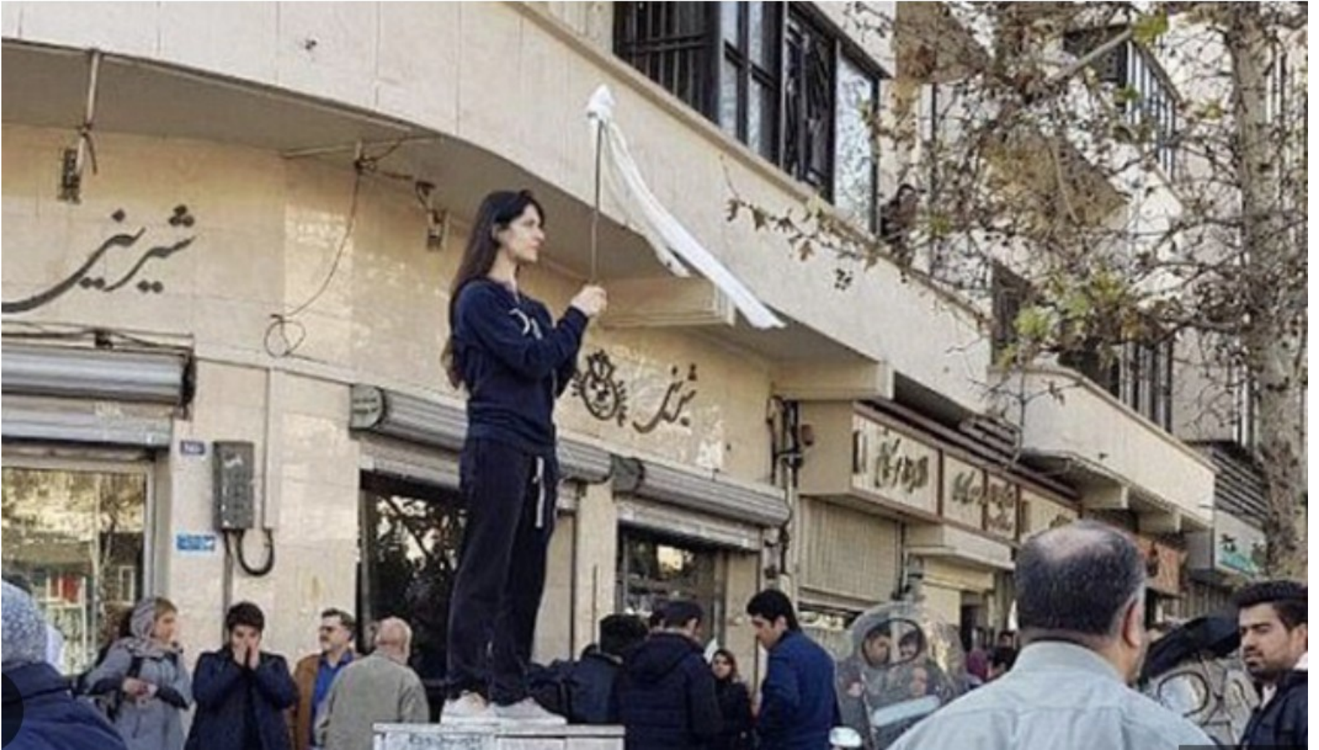
Vida Movahed (1985)