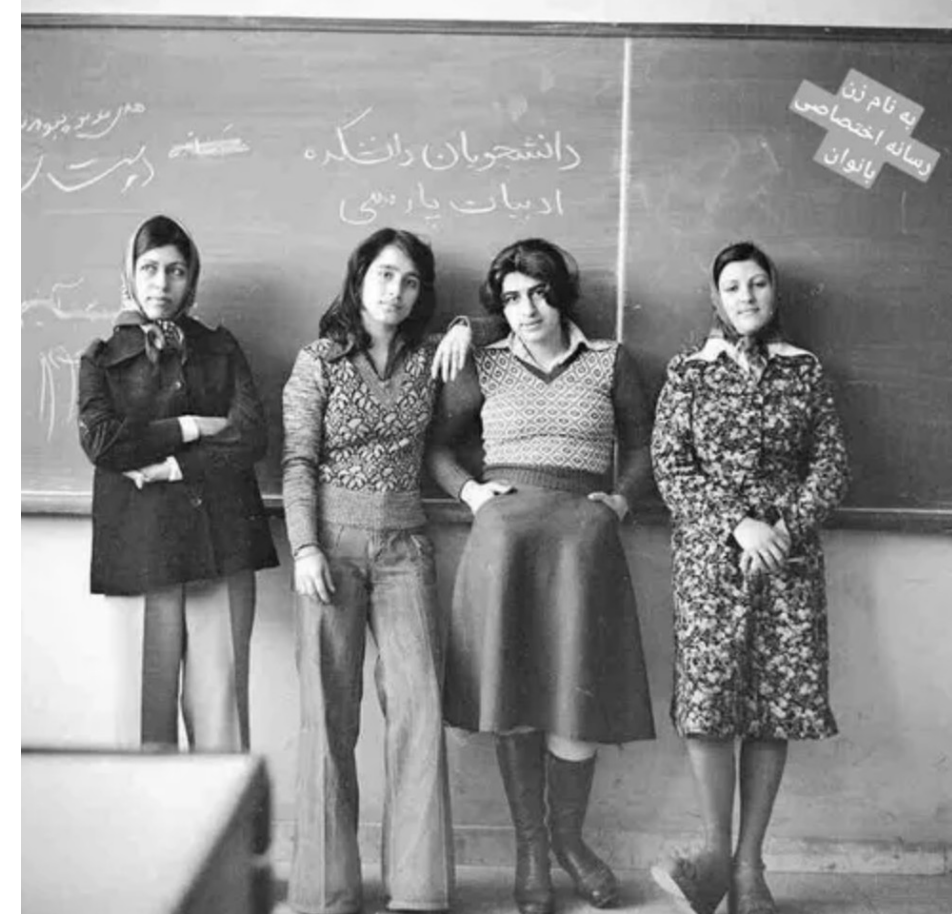
Tehran University, 1934