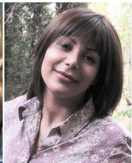
Neda Agha Soltan (1983 - 2009)