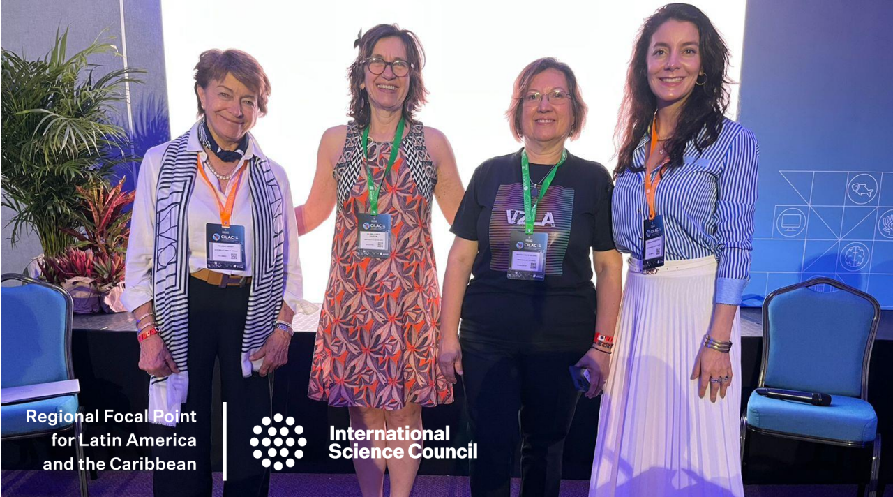
Regional Focal Point for Latin America and the Caribbean