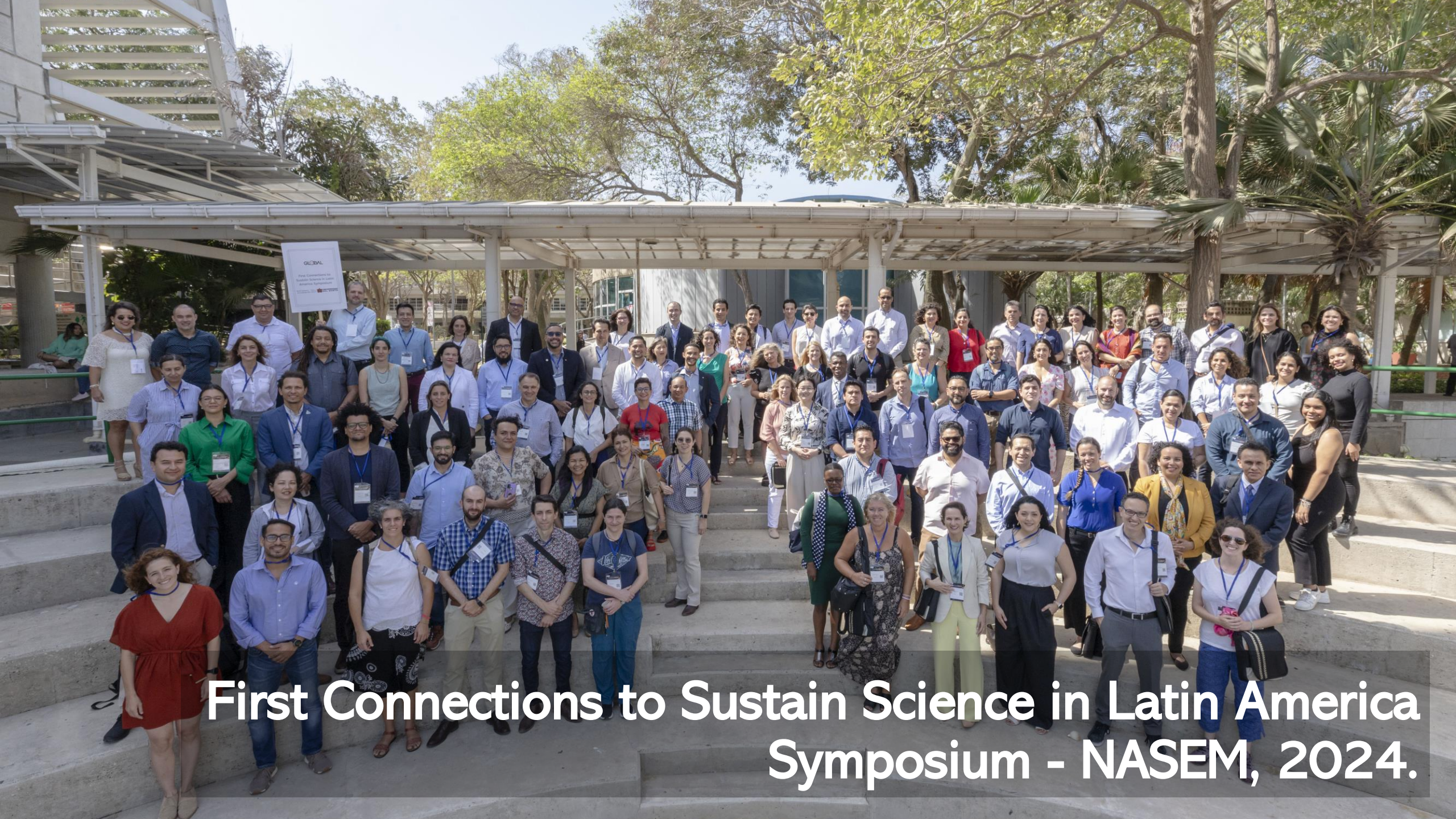
First Connections to Sustain Science in Latin America Symposium - NASEM, 2024.