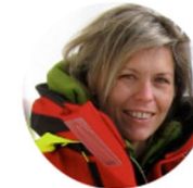
Sabrina Speich Co-chair Ocean Observations Physics and Climate Panel of Global Climate Observing System (GCOS)